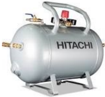
UA3810AB 10GL RESERVE AIR TANK

HITACHI 10GL ASME CERTIFIED RESERVE AIR TANK. INCLUDES REGULATOR AND ALL FITTINGS. LEAD LINE TO THIS TANK KEEPS INCREASED AIR STORAGE CLOSER AND LESS COMPRESSOR NOISE.