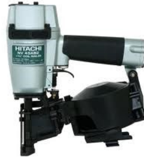
NV45AB2 COIL ROOF NAILER .

HITACHI'S OLD STYLE RELIABLE COIL ROOFER. FAST DRIVING, MANEUVERABLE, AND DEPENDABLE . SIDE LOAD. 7/8" - 1-3/4" CAPACITY. BONUS HITACHI 19413QP POLY AIR HOSE. A $39 VALUE