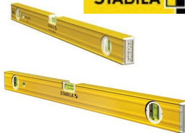
# 29048 48"