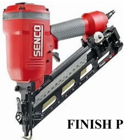
FINISH PRO 42XP

PRO GRADE 15 GAUGE FINISH NAILER. 1-1/4"-2-1/2" ANGLED FINISH NAILS. THIS IS THE ONE EVERYBODY ELSE COPIED. NEVER LUBE DESIGN. RUGGED & DEPENDABLE. CHECK OUT OUR FINISH NAIL PRICES!!!