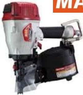
CN890F2 FRAMING COIL

PRO GRADE COIL FRAMING NAILER THAT PRETTY MUCH DOES ALL FRAMING JOBS. 1-1/2"-3-1/2" CAPACITY. LIGHT-WEIGHT AND VERSATILE. MAINTENANCE FREE SAND FILTER IN THE END CAP, DIAL A DEPTH, RAFTER HOOK,