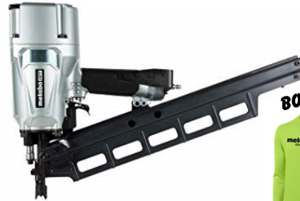
NR83A5S FRAMING NAILER

HITACHI metabo HPT HITACHI POWER TOOLS DURABILITY FIRST