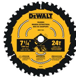
DWA171424 10 PACK 7-1/4" BLADES

DEWALT'S NEW PREMIUM BLADE. THIN KERF & LOW VIBE. REINFORCED SHOULDER & TOUGH TRACK DESIGN FOR ACCURATE TRACKING, ANTI-STICK COATING, HIGH DENSITY TUNGSTEN CARBIDE FOR LONG LIFE. ON SALE NOW.