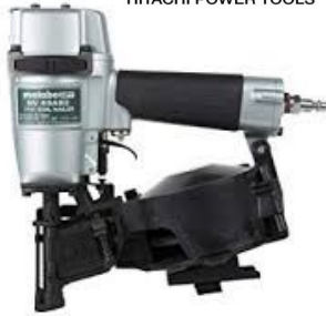
NV45AB2 COIL ROOF NAILER .

HITACHI metabo HPT HITACHI POWER TOOLS DURABILITY FIRST