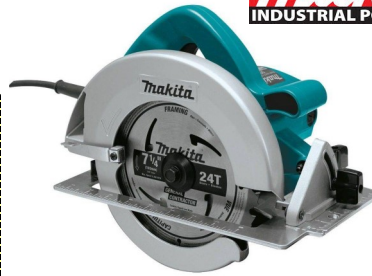
5007F 7-1/4" CIRC SAW

7-1/4" CIRC SAW. EVERYONES FAVORITE. 15AMP, BUILT IN LED LIGHT, BUILT IN DUST BLOWER, HEAVY GAUGE ALUMINUM BASE, WELL BALANCED., NUFF SAID.