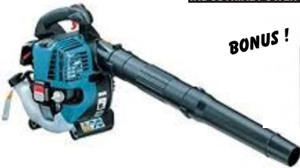
BHX2500CA 4 STROKE BLOWER

24.5CC POWERFUL 4 STROKE GAS BLOWER. NO FUEL MIX REQUIRED ,LOWER EMISSIONS, LARGE CAPACITY MUFFLER, FOR QUIETER OPERATION, LOWEST WEIGHT IN ITS CLASS, COMPACT SIZE, 356CFM, BONUS MAK ALUM. WATER BOTTLE.