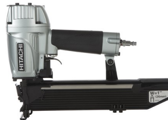
N5024A2 16GA WIDE CROWN STAPLER