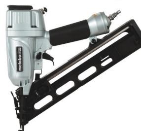
NT65MA4 15GA. FINISH NAILER