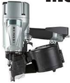
NV83A5 COIL FRAMER