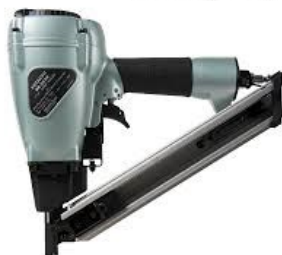
NR38AKM JOIST HANGER NAILER