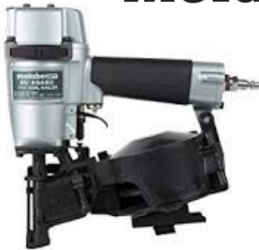
NV45AB2 COIL ROOF NAILER.