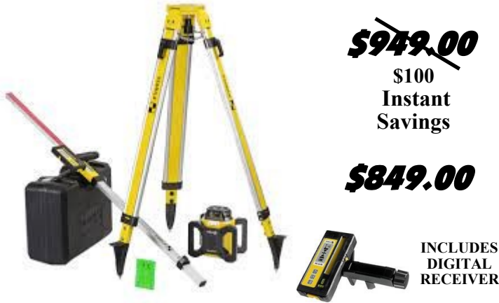
LAR160G ROTARY LASER SET

HIGH PERFORMANCE GREEN BEAM ROTARY LASER KIT. MOTOR DRIVEN, DUST & WATER PROOF, USES D BATTERIES, SELF LEVELING, SIMPLE AND PRECISE, COMPLETE W/LASER, DIGITAL RECEIVER, ADJ. TRIPOD, TARGET, CARRY CASE.