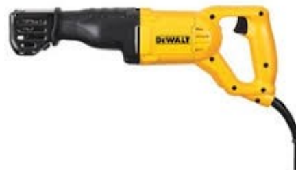
DWE305 RECIP SAW

DEWALT 12 AMP HEAVY DUTY RECIPROCATING SAW. VARIABLE SPEED TRIGGER & 1-1/8" STROKE LENGTH FOR FAST CUTTING, LEVER ACTION KEYLESS 4 POSITION BLADE CLAMP FOR INCREASED VERSATILITY. WT 7.0 LB.