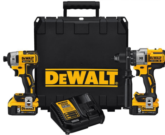
DCK299P2 20V MAX HAMMER DRILL/IMPACT KIT

20 VOLT MAX CORDLESS BRUSHLESS XR HAMMER DRILL/IMPACT COMBO KIT. KIT COMES WITH 2 X 5.0AH BATTERIES. DCF 887 IMPACT & DCD996 HAMMER DRILL . DEWALT'S TOP OF THE LINE KIT. ON SALE NOW.