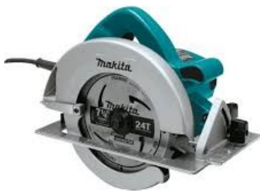
5007F 7-1/4" CIRCULAR SAW

POWERFUL 15AMP 7-1/4" CIRC SAW, WELL BALANCED, PROVEN PERFORMANCE AND JOBSITE DURABILITY, HEAVY GA. ALUM. BASE, 2 BUILT IN LED LIGHTS, BUILT IN DUST BLOWER, BONUS ULTRA THIN B-61656 BLADE A $10 VALUE.