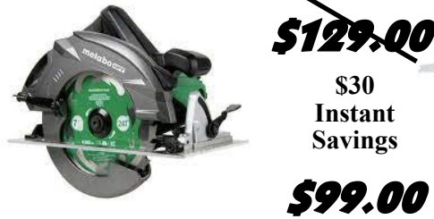
C7URM 7-1/4" CIRCULAR SAW

1" SDS PLUS ROTARY HAMMER, 8AMP MOTOR, 3-MODE VARIABLE SPEED, LIGHT WEIGHT 6.9LB,