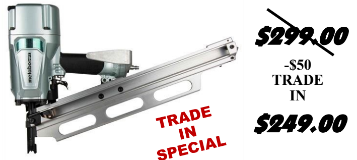
NR83A5S1 FRAMING NAILER

METABO 21 DEG FULL ROUND HEAD STRIP FRAMING NAILER WITH NEW ALUMINUM MAGAZINE AND OLD SCHOOL FAST TRIGGER, RAFTER HOOK. TRADE IN YOUR OLD TOOL AND GET $50 TRADE IN VALUE THIS MONTH.