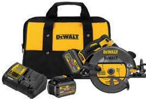
DCS578X2 60V 7-1/4" CIRC SAW KIT. 2 X 9AH BATTERIES

FLEXVOLT 60V MAX 7-1/4" CORDLESS CIRCULAR SAW WITH BRAKE. 40% MORE POWER THAN THE PREVIOUS MODEL POWER OF CORDED WITH CONVENIENCE OF CORDLESS. LED CUT LINE. INCLUDES 2 X DCB609 9AH BATTERIES.