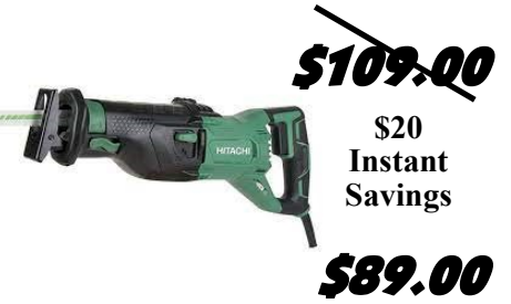
CR13VSTM 11 AMP RECIP SAW

RIPMAX 7-1/4" 15AMP CIRCULAR SAW. STAMPED ALUMINUM BASE. BUILT IN DUST BLOWER, ANTI-VIBE SYSTEM.