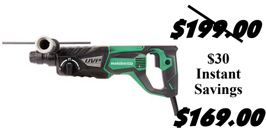
DH28PFYM SDS + 1" ROTARY HAMMER

1" SDS PLUS ROTARY HAMMER, 8AMP MOTOR, 3-MODE VARIABLE SPEED, LIGHT WEIGHT 6.9LB,