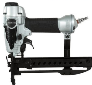
N3804AB3 18GA STAPLER

18GA NARROW CROWN STAPLER. 1/2" - 1-1/2" STAPLES TOOL FREE DEPTH OF DRIVE. 360DEG EXHAUST 2.3LB LIGHTWEIGHT AND WELL BALANCED. E-Z CLEAR NOSE.