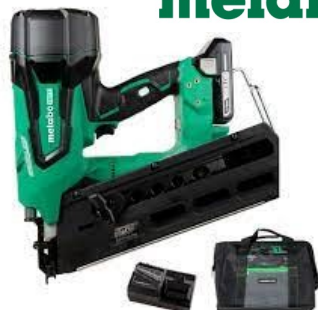
NR1890DRSTM CORDLESS FRAMER KIT

18V CORDLESS FRAMING NAILER, 21DEG STRIP NAILS 2" - 3-1/2" UNIQUE AIR SPRING DRIVE SYSTEM REQUIRES NO FUEL, BRUSHLESS MOTOR, CHARGER, 4AH BATT, BAG.