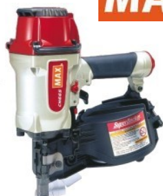
CN665D COIL DECKING NAILER

PRO GRADE COIL NAILER. 1-1/2" - 2-1/2" .099 - .131 NAIL SIZES. RAPID FIRE TRIGGER, END CAP FILTER, DIAL ADJUSTABLE DEPTH CONTROL, TRADE IN COMPETITIVE TOOL AND SAVE!