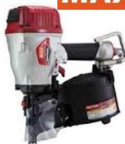
CN890F2 FRAMING COIL NAILER

PRO GRADE COIL FRAMING NAILER 1-1/2" - 3-1/2" LIGHT- WEIGHT, MAINTENANCE FREE SAND FILTER, DIAL A DEPTH, RAFTER HOOK, TRADE IN COMPETITIVE TOOL AND SAVE!