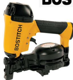
RN46-1 ROOFING NAILER

FAST, DURABLE AND FAST LOADING, ADJUSTABLE DEPTH, DRY FIRE LOCK-OUT, WEAR GUARDS, SKID PADS, NOSE PIECE FEATURES CARBIDE INSERTS, LIGHTWEIGHT 4.9LBS.